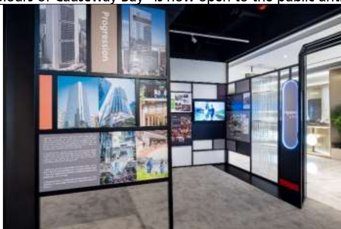
Five themes, Legacy, Culture, Dream, Progression and Connection, anchor the exhibition.