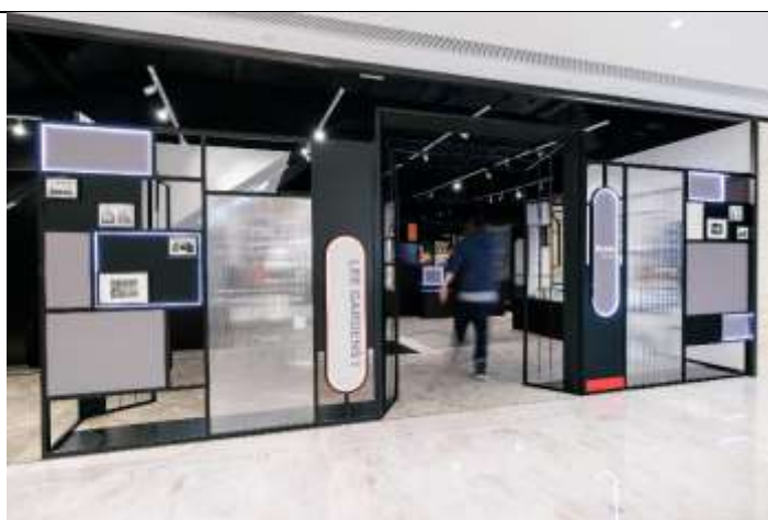
“The Colours of Causeway Bay” is now open to the public until 19 July.