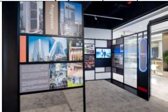
Five themes, Legacy, Culture, Dream, Progression and Connection, anchor the exhibition.