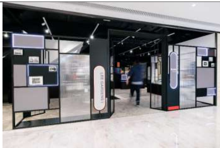
“The Colours of Causeway Bay” is now open to the public until 31 July.