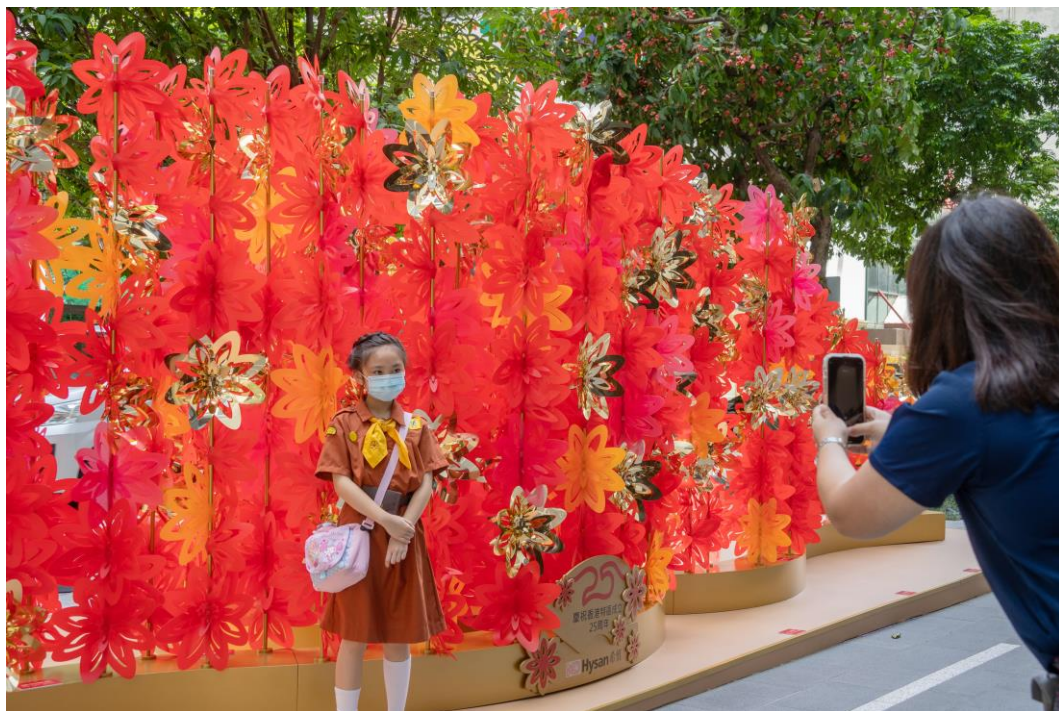
Hysan hopes to attract the public to join in with the celebrations with this meaningful installation