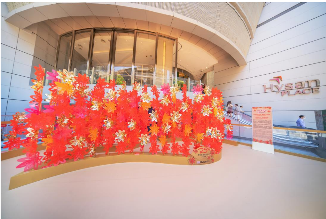
The “Summer Blossoms by Lee Gardens” art installation is exhibited at Lee Garden One and Hysan Place