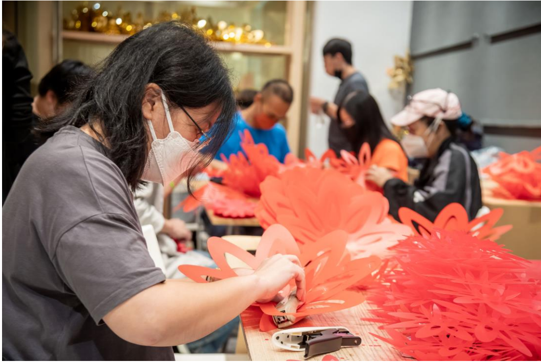
The production of the 5,000 Lee Gardens Flowers is supported by Wofoo Leader's Network of Hong Kong Institute of Vocational Education (Kwun Tong) and Women Sewing Union, a non-profit organisation