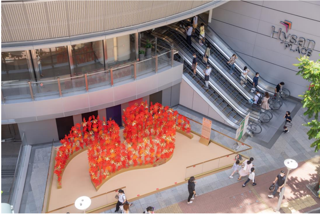
The floral installation in a dynamic pathway in the shape of the number “25” looking from above